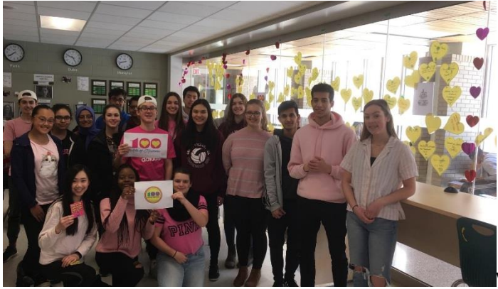
100 Acts of Kindness

Saskatchewan Business Teachers Association (SBTA) Case Competition (May) Manitoba Case Competition (May) Campbell Business Celebration Awards Night (June)