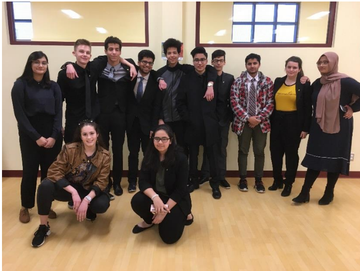
Case Competition at Huda School